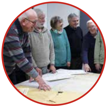
Wythenshawe History Group