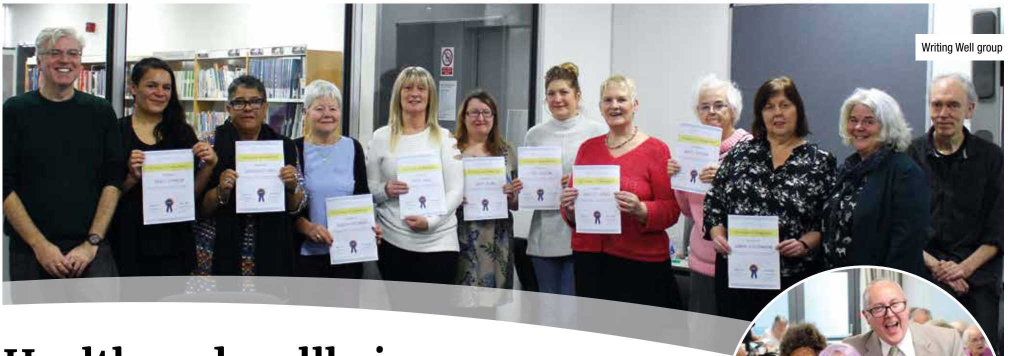
Writing Well group