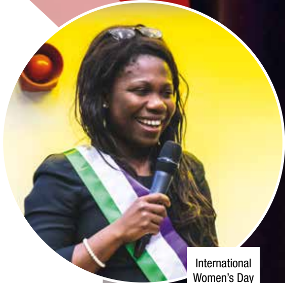
International Women's Day